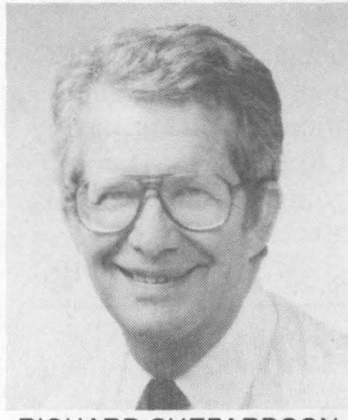
tomer service as our prime objectives. Of course, embedded in this will be the other Labs values. I am